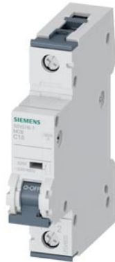
Circuit breaker Universal current 220 V DC 230/400 V AC 10kA, 1-pole, C, 1.6 A