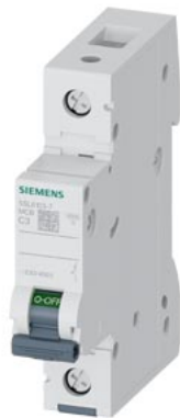
Miniature circuit breaker 230/400 V 6kA, 1-pole, C, 3A