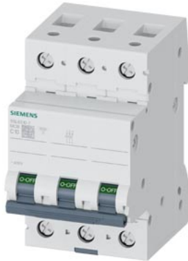
Miniature circuit breaker 400 V 6kA, 3-pole, C, 10 A