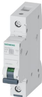
Miniature circuit breaker 230/400 V 6kA, 1-pole, C, 2A