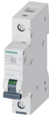
Miniature circuit breaker 230/400 V 6kA, 1-pole, C, 40 A